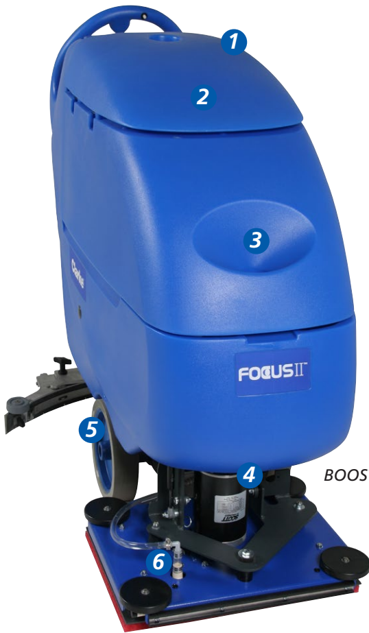
BOOST ® L20 Shown