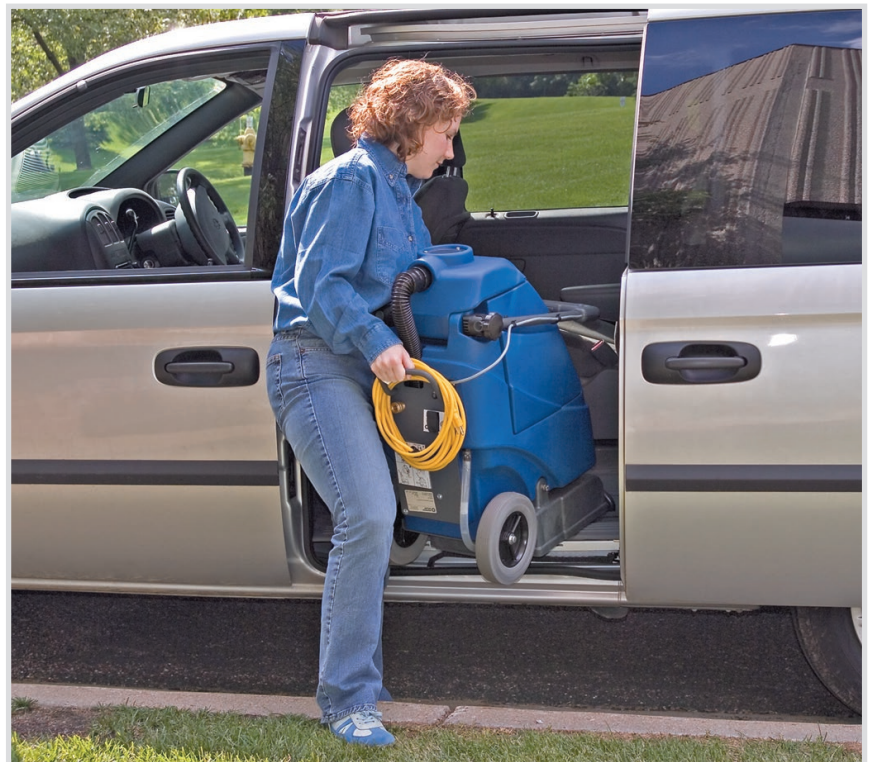
Hand grips and compact folding simplify easy lifting and transport.