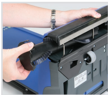
Easy to change brush. Simply unlock the brush and pull out.