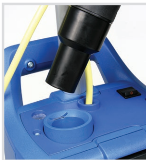
Hose removes for quick clog checks.