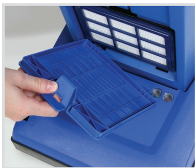
Convenient access to standard H.E.P.A. filter.