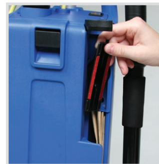
Tool and storage compartment is located directly behind the quick-draw wand.